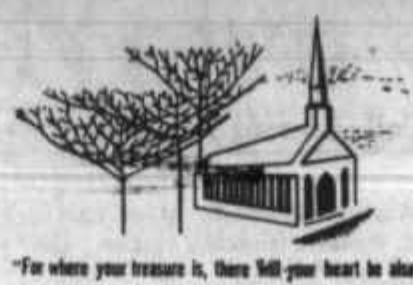
"For where your treasure is, there will your heart be also."